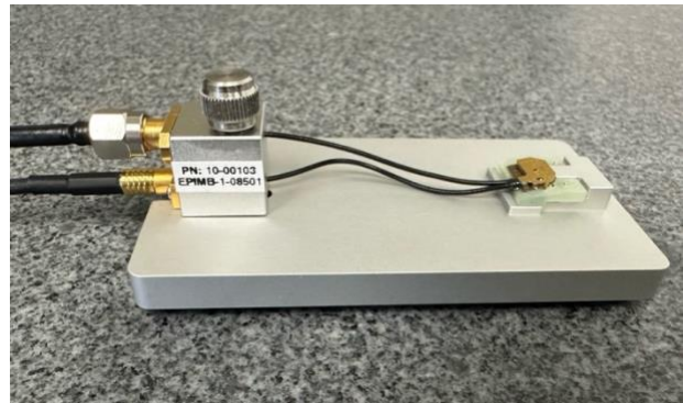
Figure 2 New ePIM.