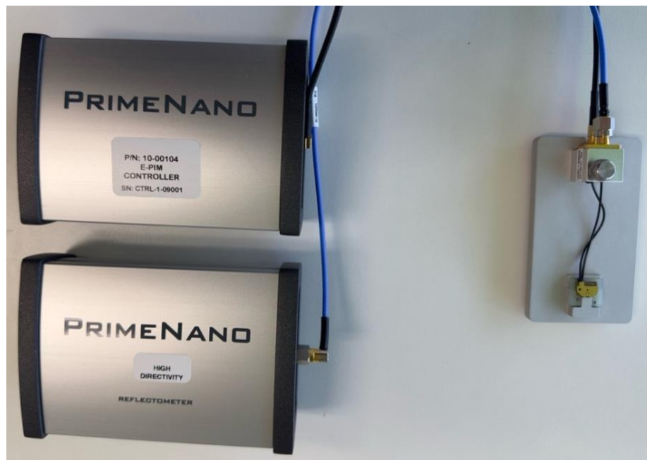
Figure 4: PrimeNano ePIM controller (top left) and reflectometer (bottom left) connected to ePIM (right).