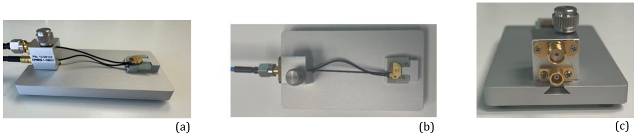
Figure 3: ePIM on Probe Loading Base, side view (a), top view (b) and rear view (c).

Probe loading with the ePIM is identical to the standard mechanical PIM. However, in addition to the reflectometer connection (SMA) of the standard mechanical PIM, the ePIM also connects to the ePIM controller (MCX – bottom connector in Figure 3c ). The reflectometer and ePIM controller cases have the same form factor but use different connectors ( Figure 4 ). This ensures the ePIM can only be connected one way.